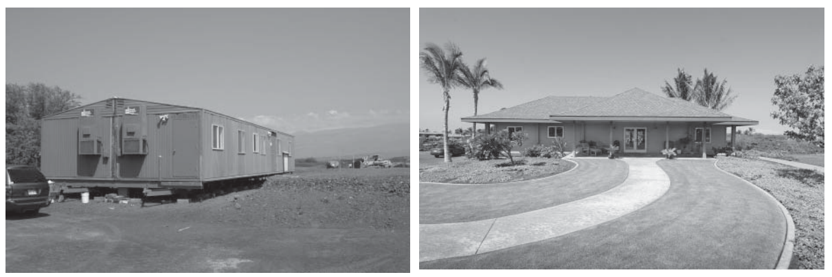
Before (left) and after (right and below) pictures of the Brookfield Homes Sales Office in Kona, HI

of flexible design and reuse. At its annual Awards of Distinction competition, the Modular Building Institute hosts a category for best "renovated reuse" of an existing building. Renovated reuse is defined as a reconfiguration of an existing factory-built commercial structure to meet the needs of an application that is different from its original design.